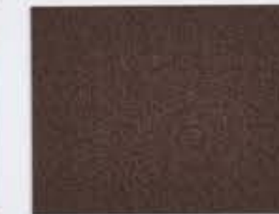
858525 525 ENGLISH BROWN