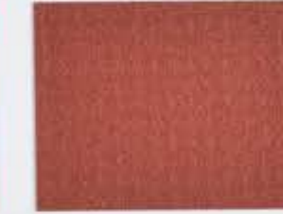
858526 526 TERRA COTTA