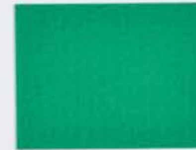
858514 514 LIME GREEN