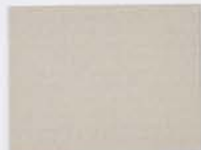
858522 522 BEIGE