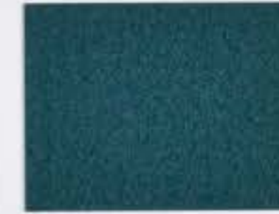
858562 562 EMERALD