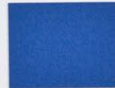
858503 503 ROYAL BLUE