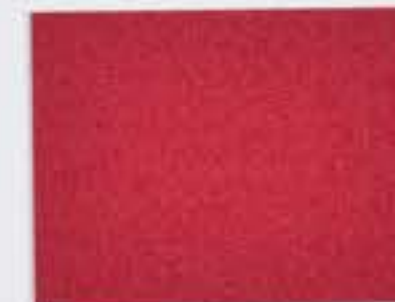
858545 545 RUBY