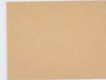
858515 515 BUFF