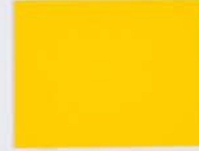
858566 566 SUNFLOWER