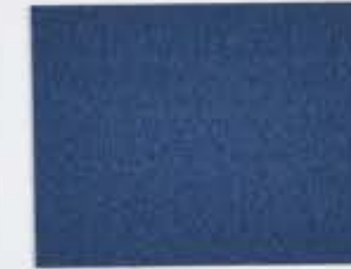
858518 518 DUSKY BLUE