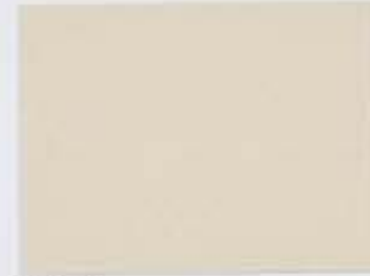
858537 537 CHAMPAGNE