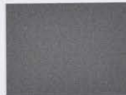
858506 506 SLATE GRAY