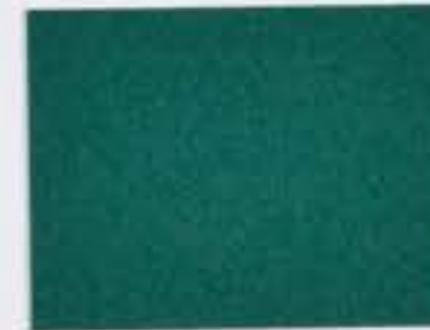
858510 510 DARK GREEN