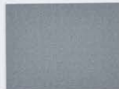
858528 528 PEWTER