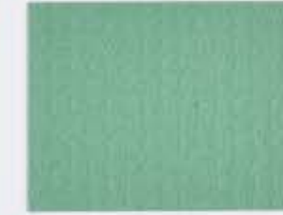
858570 570 SUMMER IVY