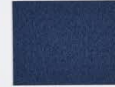
858536 536 COBALT BLUE