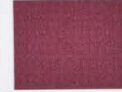
858527 527 BURGUNDY