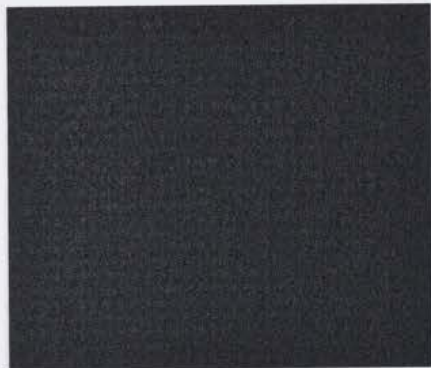
858508 508 BLACK

Flame resistance meets or exceeds the standards of California Fire Marshal, NFPA 701 TM2, and ASTM E-84, Class A.