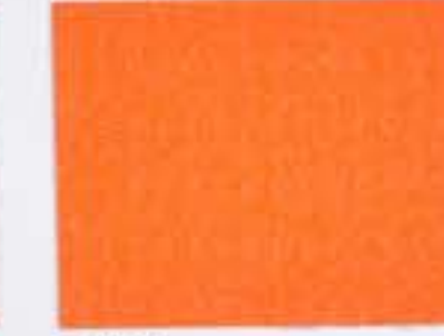
858544 544 SUNSET ORANGE