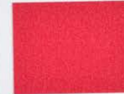
858529 529 BRIGHT RED