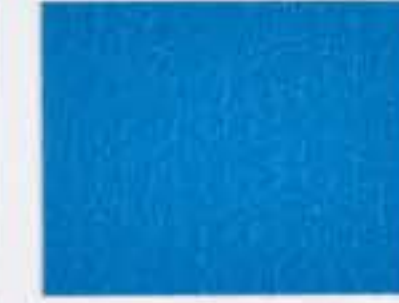
858539 539 BAY BLUE