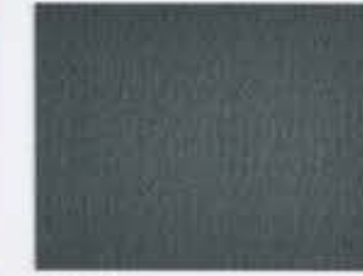
858543 543 SPRUCE