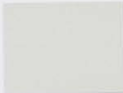
858538 538 PARCHMENT