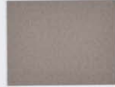
858540 540 TIMBER