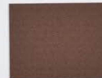
858516 516 BROWN