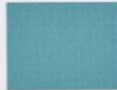
858564 564 TEAL