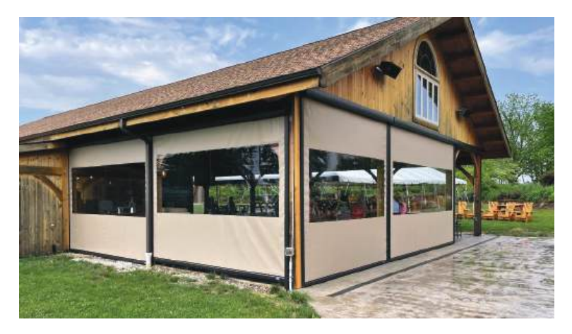
Create an enclosed space! We can add motorized retractable screens to the sides of your existing structure.

With the push of a button you have complete control over incoming light and ventilation. The roof and/or sides easily open and close.