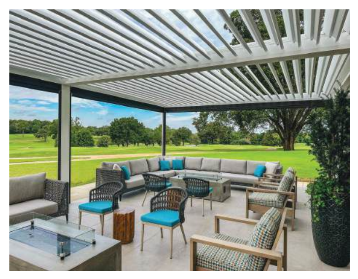
A pergola/patio cover creates an atmosphere of relaxation, and pure enjoyment for customers.

Transform your patio, sidewalk, rooftop, garden or parking lot into a luxurious space, your guests will love, with our retractable pergola/patio enclosures.